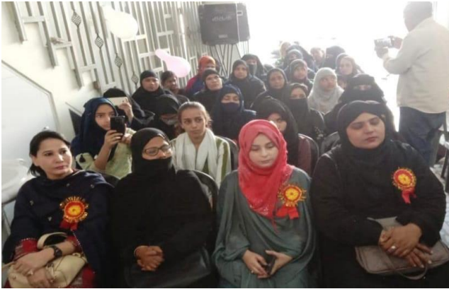
Women Awareness Programs