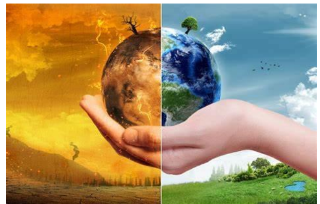
Climate Change Awareness