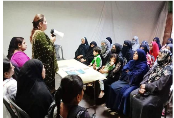
Career Counselling Programs