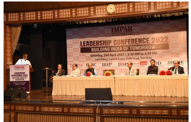
Formation of Executive Bodies